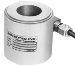
Model TH (Compression Only)